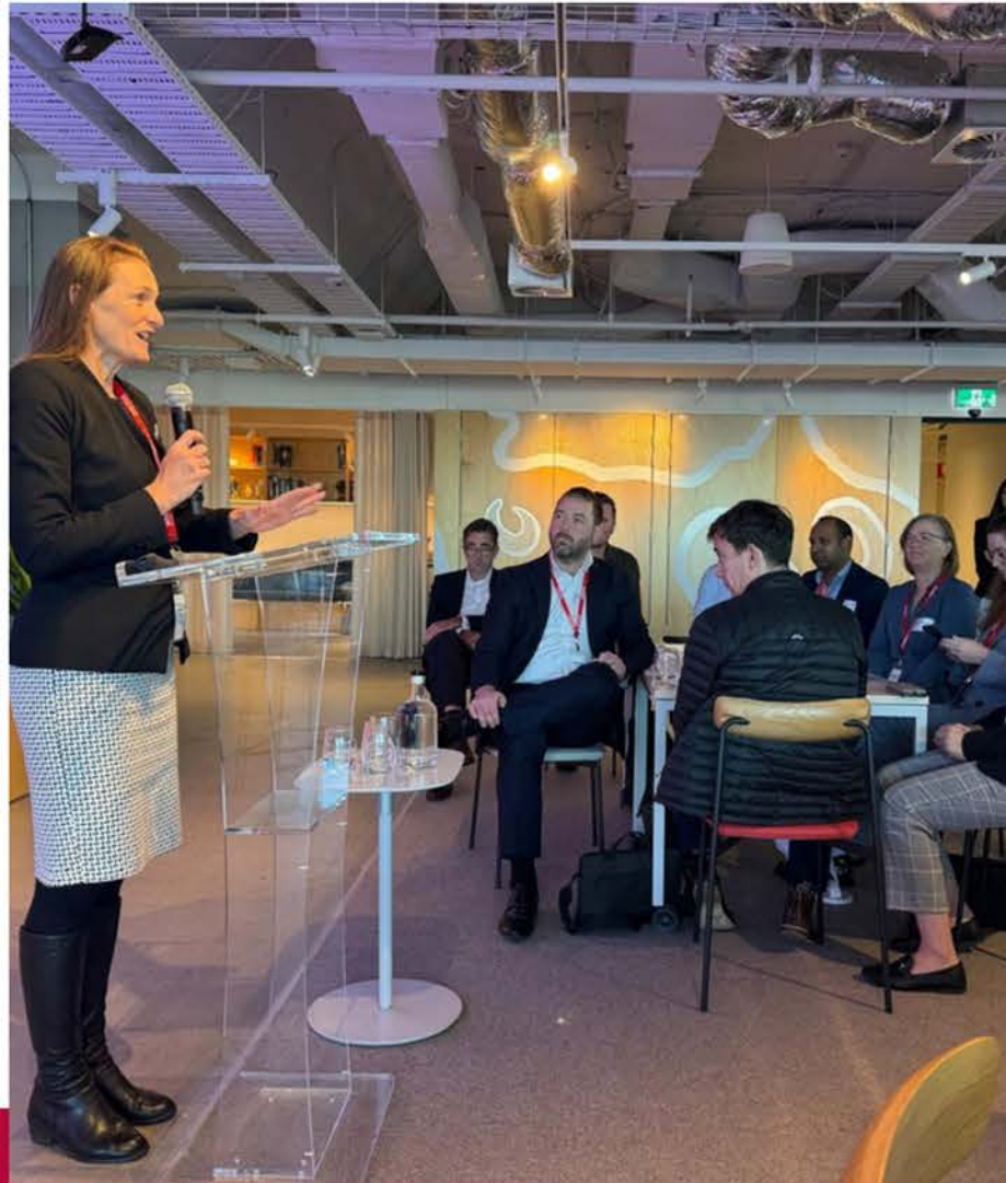
Strategic policy roundtables