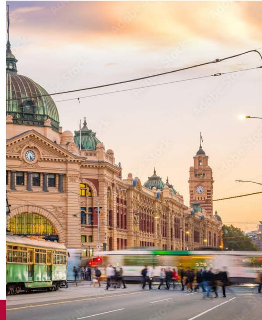
Research and analysis