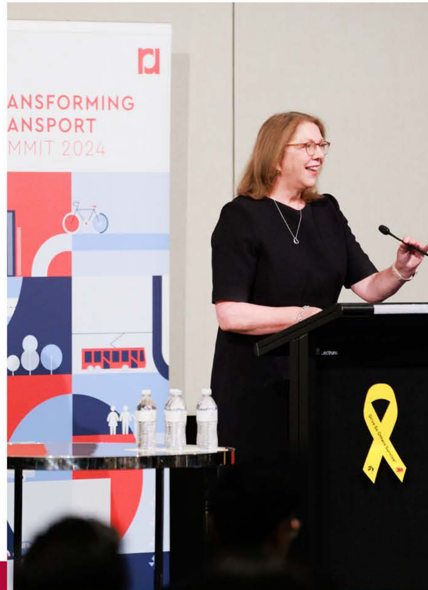
Transforming Transport Summit